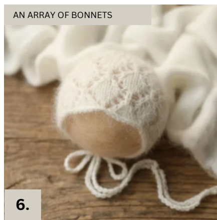
AN ARRAY OF BONNETS