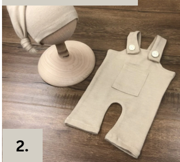
BEIGE OVERALLS - M