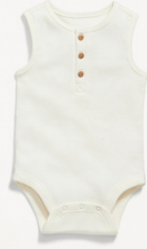
WHITE ONESIE - L