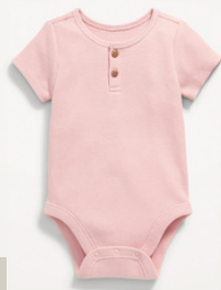
PINK ONESIE - L