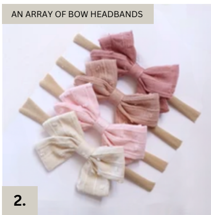
AN ARRAY OF BOW HEADBANDS