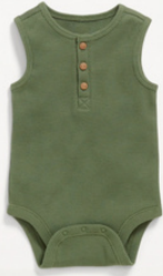
GREEN ONESIE - L