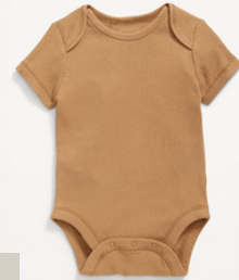
RUST ONESIE - L