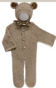
BROWN MOHAIR BEAR - M/L