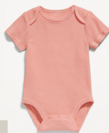
PINK ONESIE - L