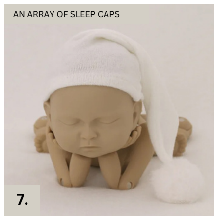
AN ARRAY OF SLEEP CAPS