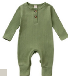
GREEN ONESIE - L