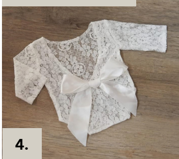
WHITE LACE - S & M