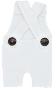
WHITE OVERALLS - M