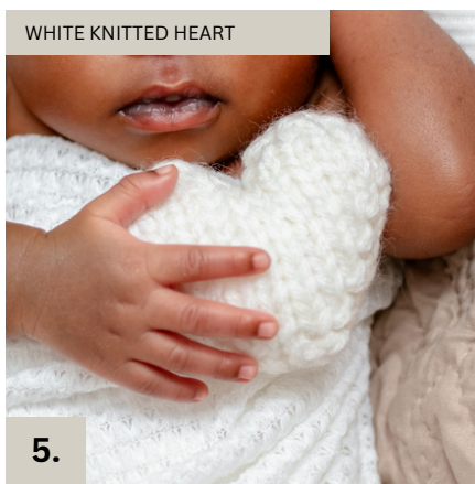
WHITE KNITTED HEART