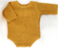
MUSTARD ONESIE - M