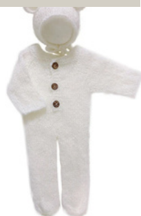
WHITE MOHAIR BEAR - M/L