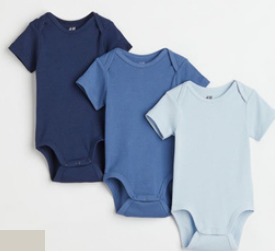
BLUE ONESIES - M