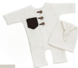
WHITE SLEEP SET - M