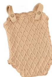
CAMEL ONESIE - L