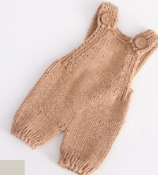
TAN OVERALLS - M