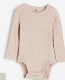
PINK TEXTURED ONESIE - M