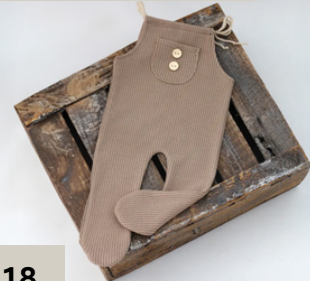
WHITE & CREAM TULLE