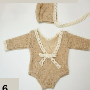
WHITE & CREAM TULLE