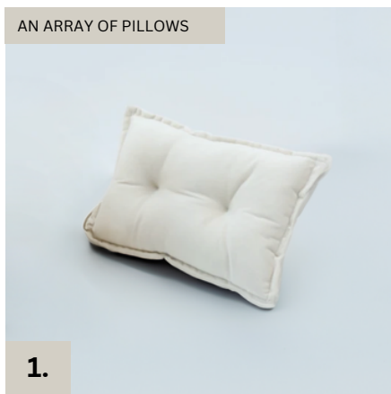
AN ARRAY OF PILLOWS

The below accessories are also available for your newborn shoot.