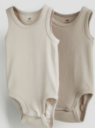
BEIGE ONESIES - M