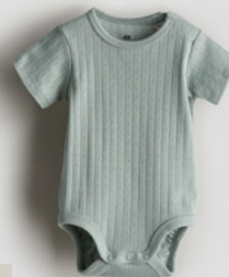
GREEN TEXTURED ONESIE - M