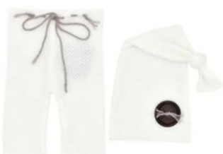
WHITE PANTS & CAP - S/M