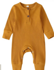
MUSTARD ONESIE - L