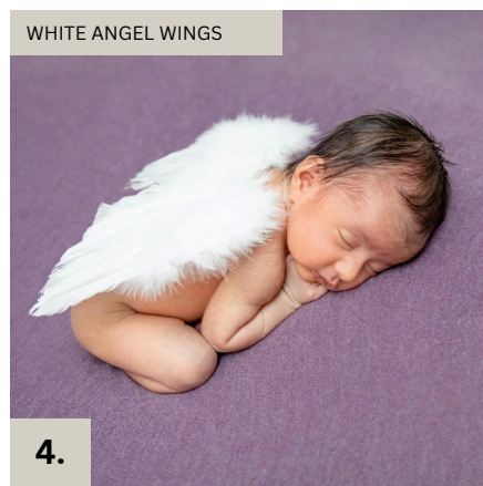
WHITE ANGEL WINGS